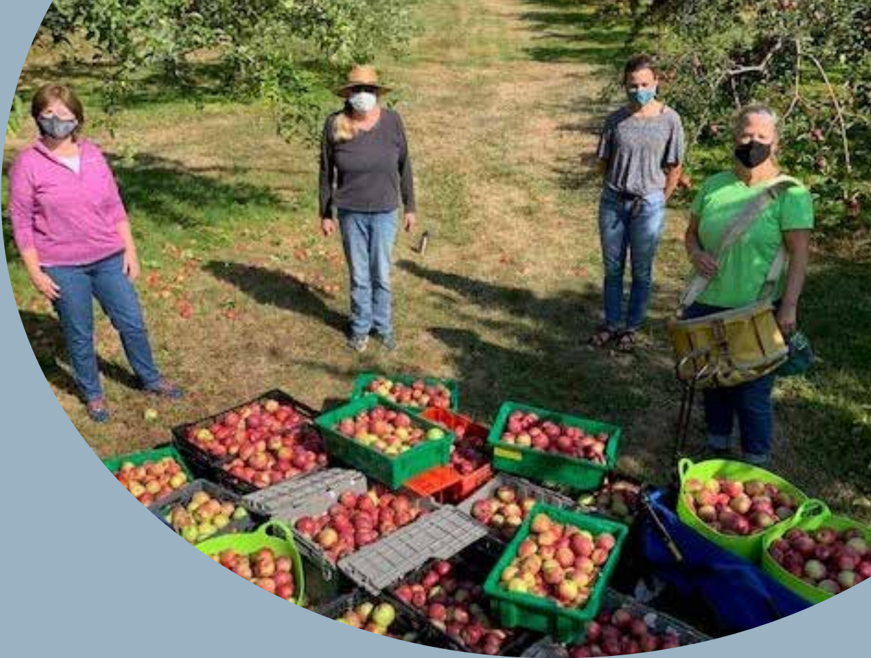
THE EDEN GLEANING AND GARDEN PROJECT AFFILIATED WITH EDEN SEMINARY