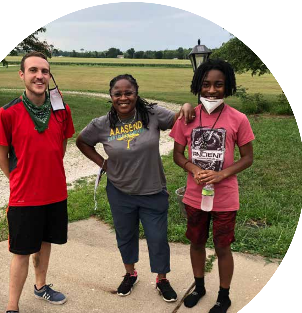
THE EDEN GLEANING AND GARDEN PROJECT AFFILIATED WITH EDEN SEMINARY

The Center for Agriculture and Food Systems is an initiative of Vermont Law and Graduate School, and this memo provides general legal information for educational purposes only. It is not meant to substitute, and should not be relied upon, for legal advice. Each gleaner's circumstances are unique, state laws vary, and the information contained herein is specific to the time of publication. Accordingly, for legal advice, please consult an attorney licensed in your state.